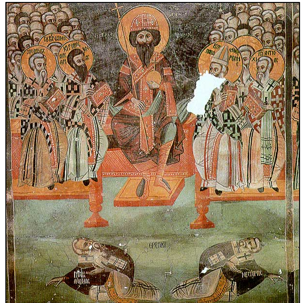
Wall fresco depicting the Council of Ephesus (431) by Simeon Axenti (1513), Church of St. Sozomenos, Galata, Cyprus